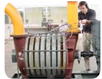
ASME PTC-10 Testing