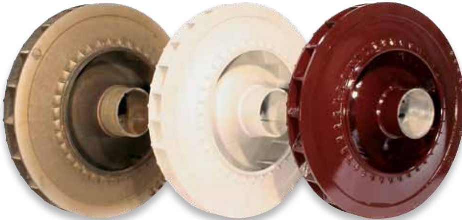
In-House Sandblasting and Heresite Coatings and Heresite Coatings.